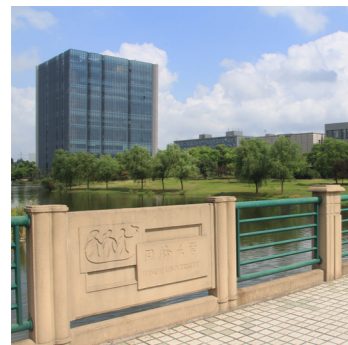
The university library on the Jiading campus of Tongji University