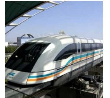
The Maglev train is connecting Pudong International Airport to Longyang Road at the center of Pudong in less than ten minutes

In the taxi, show the relevant Taxi Card to the driver. Remember that most taxi drivers neither speak English, nor will they understand spoken directions like "Tongji University". The taxi fare to the city center is around 60 RMB, depending on traffic conditions. All taxi companies have the same fares, including the VW Touran taxis. Credit cards are not accepted, only cash or the Shanghai transportation card. The journey will take around 20 minutes and up to 45 minutes during rush-hours.