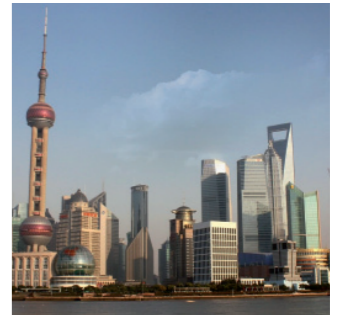
Shanghai's famous skyline on the Pudong side of Huangpu river showing the Oriental Pearl Tower (left) and Shanghai World Financial Center (right)

Visitors to China must fill out a customs form upon arrival. When you enter the country you are asked to declare electrical goods and luxury items such as cameras, computer equipment etc. Keep this form until you exit to avoid paying duty on goods you brought into the country. There are no restrictions on the amount of foreign currency you can bring into the country. However, one must declare any cash exceeding EUR 10,000 or the equivalent.